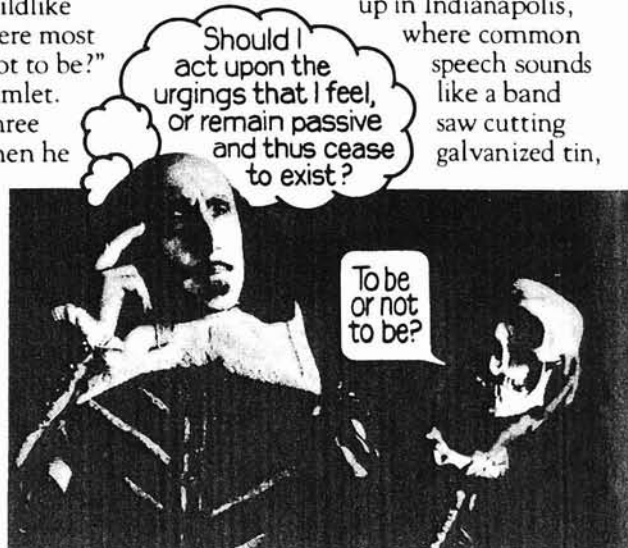
"Keep it simple. Shakespeare did, with Hamlet's famous soliloquy."

The writing style which is most natural for you is bound to echo the speech you heard when a child. English was the novelist Joseph Conrad's third language, and much that seems piquant in his use of English was no doubt colored by his first language, which was Polish. And lucky indeed is the writer who has grown up in Ireland, for the English spoken there is so amusing and musical. I myself grew up in Indianapolis, where common speech sounds like a band saw cutting galvanized tin,